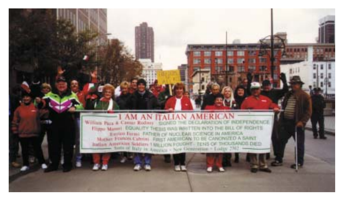
Italian Americans like these in Denver, Colorado, celebrate their heritage on Columbus Day with parades and festivals.