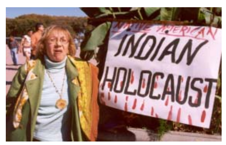
Activists like this one at a recent Columbus Day Parade in Chicago blame Columbus for actions that happened long after his death in 1506.